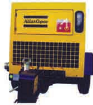
Dust Free - Fully enclosed canopy