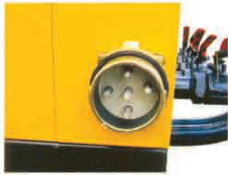
Plug & play