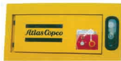
Motor overload indicator - Emergency stop