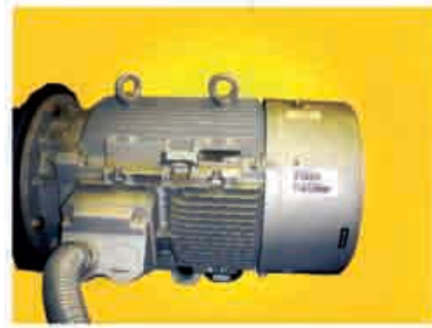
Power Efficient Siemens Motor