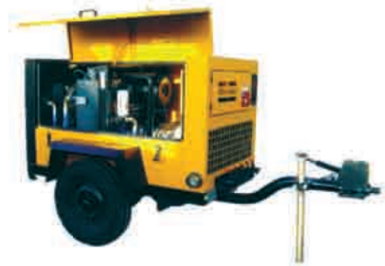
Servicability - Easy access